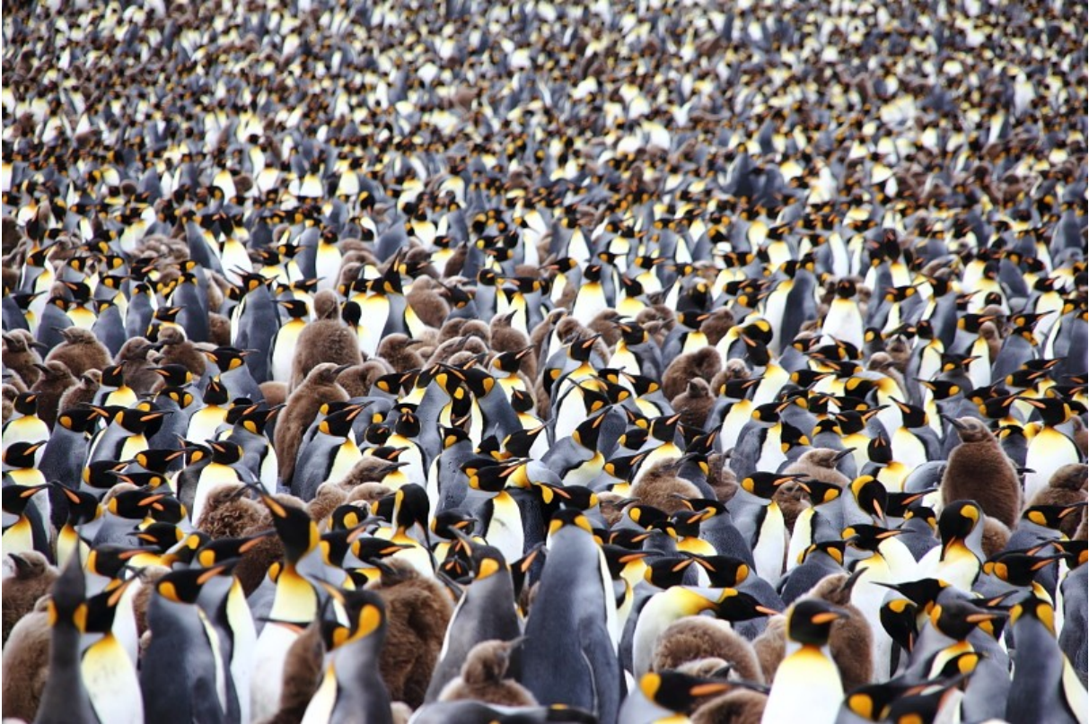
King penguin colony.