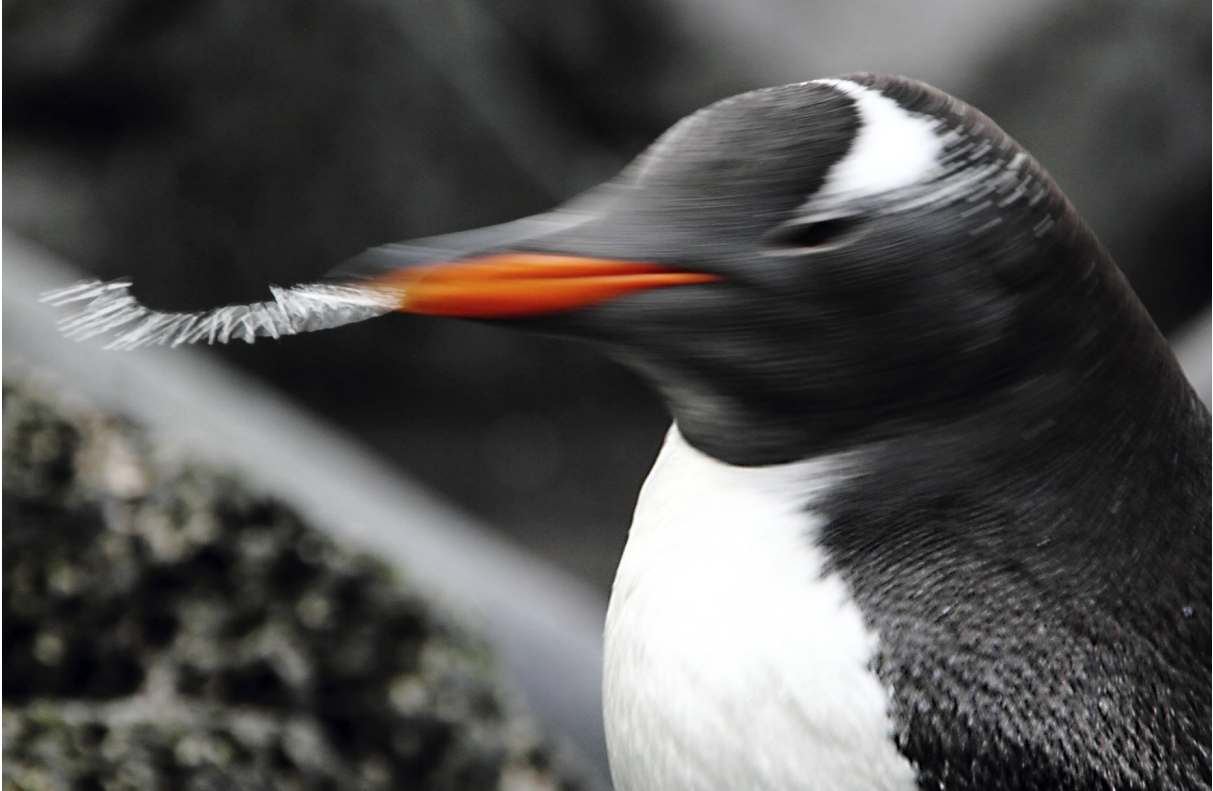
Above: a Gentoo penguin.