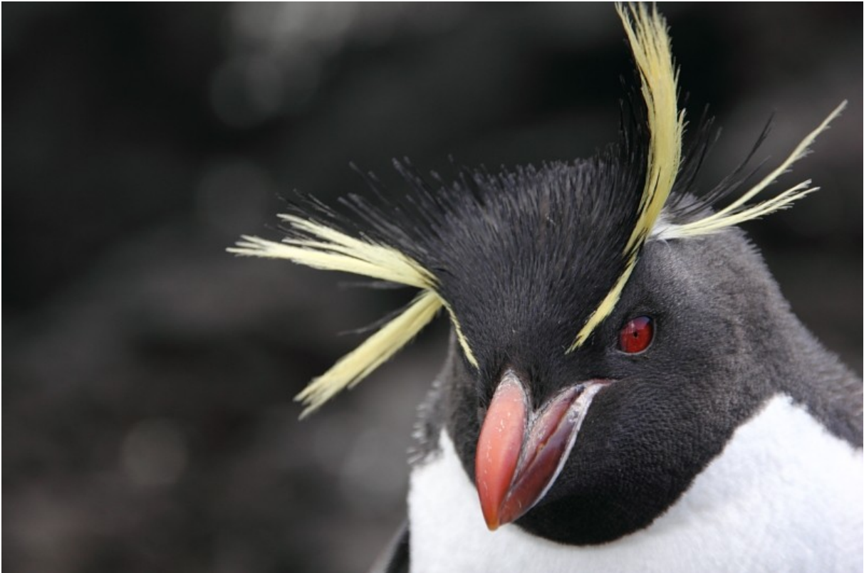
Below: a rocky penguin.