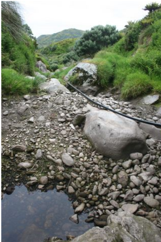
Our dried up water supply

Lots of people know that Gough is a wet place because it rains a lot. This time around it was a different situation. The river (which provides water to the base) was so dry in beginning of the month that we ran out water. We had (at least) enough water to cook, but not enough for a shower. (I won't mention anything about the toilet). We spent some few days without showering but bathing with very little water in the basin. (It was a nice experience...yo...)