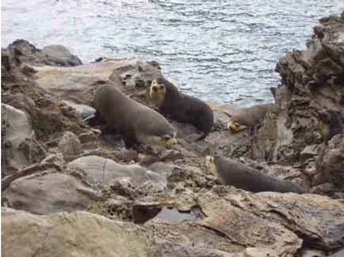
The other Gough Island residents

Uiteindelik op die strand, rots en robbe oral in sig.