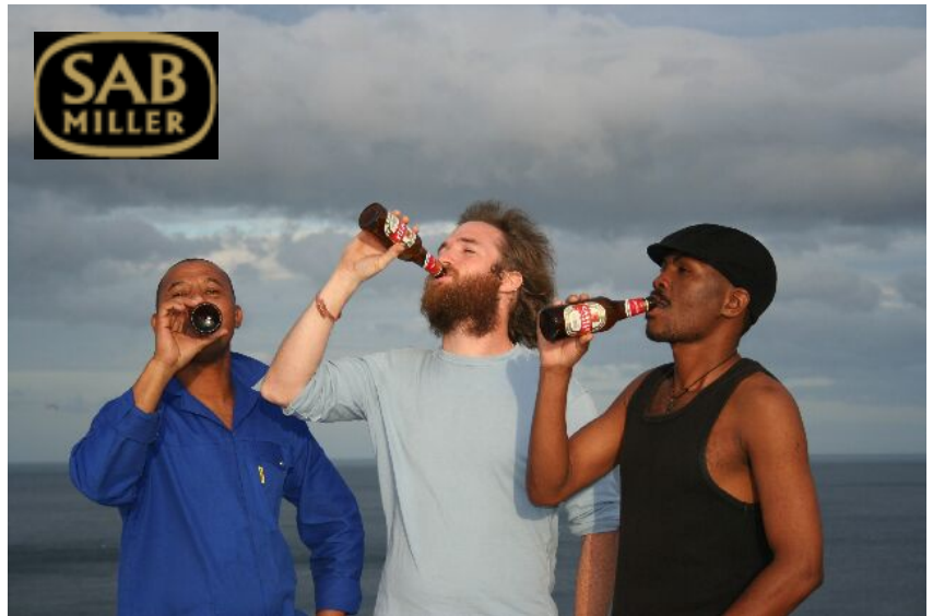
Castle Lager helped us Celebrate our New Years in style.