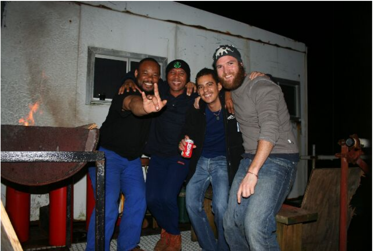
The Skuas enjoying themselves late at night.