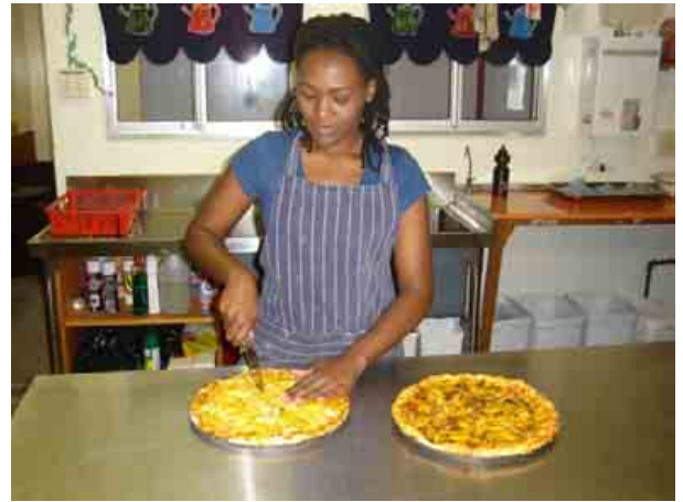
I was busy preparing pizza for lunch, it was delicious.