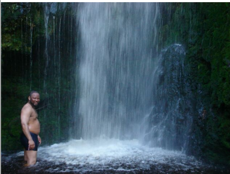
Waterfall called "Swem Gat"

Stress is a process of comprising a sequence of events that lead to a particular outcome. The outcome can be favourable – you can deal with stress constructively and use it to your advantage (working harder, getting that promotion. Good). Or the outcome could be unfavourable – when the demand overwhelms you and you respond in ways which are not beneficial to yourself or those around you. Below is one of the places at Gough Island that you will never get stress.