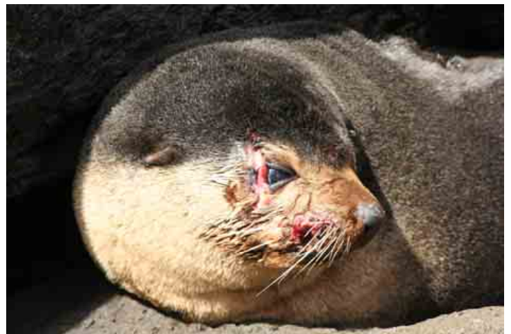
You should see the other guy.