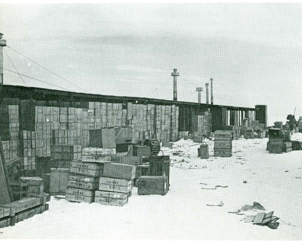
The scene just east of the sleeping quarters. Photos like this were used to locate supplies after the first bad storm experienced by Sanae 3.

Die winter nader nou vinnig. Dit kan opgemerk word aan die aktiwiteit van die dierebevolking en ook weer-gewys is daar 'n merkbare verandering. Die eerste sneeuvalle het voorgekom in die berge.