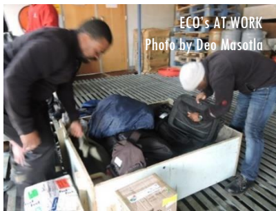
ECO'S AT WORK