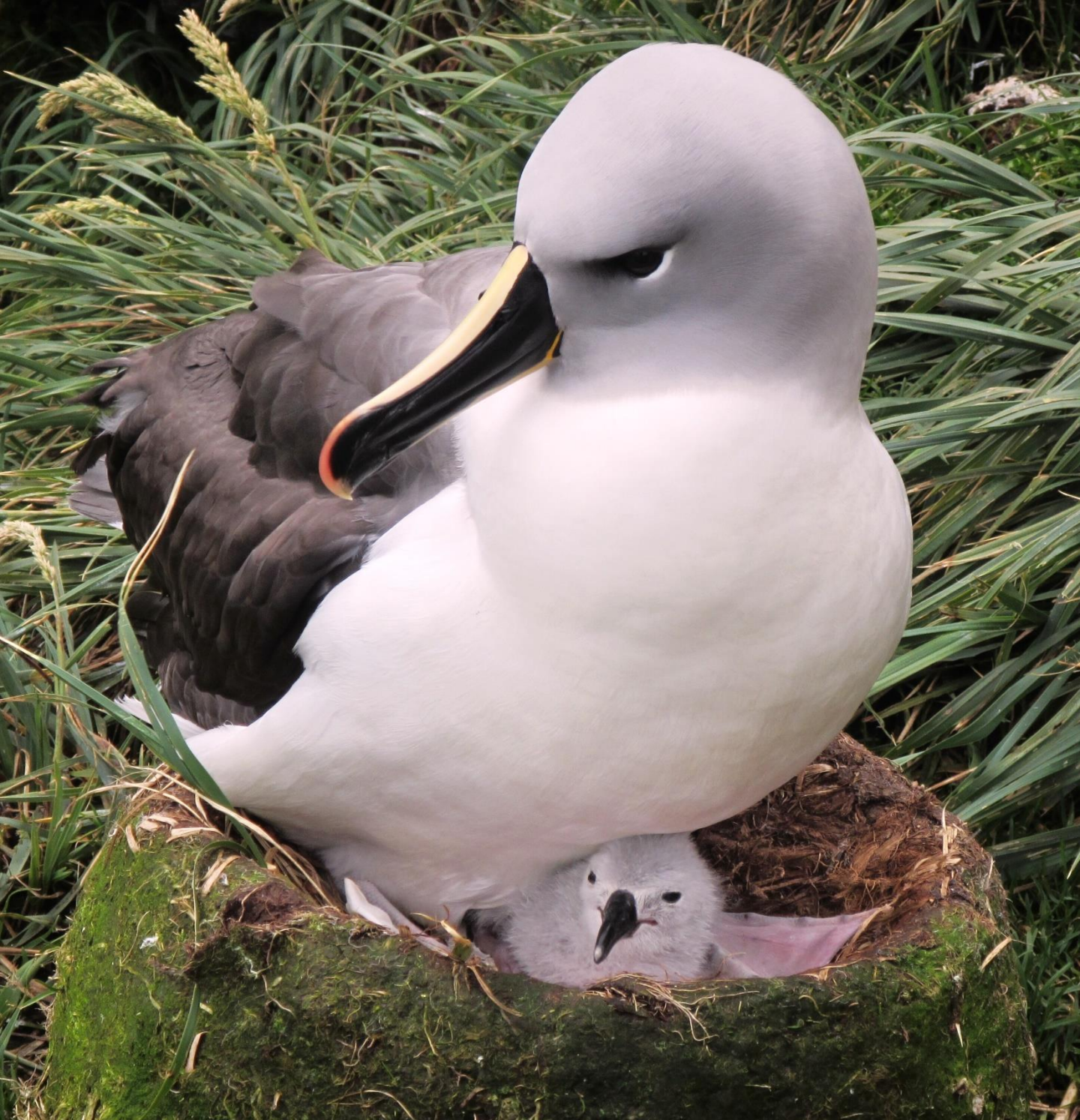
Grey-Headed Albatross and Chick