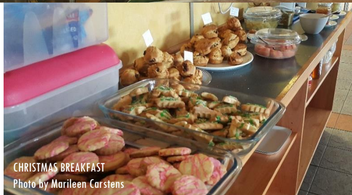
CHRISTMAS BREAKFAST

Christmas day was bright and sunny. It started off with a Christmas breakfast table in the dining room generously set by Elana who had baked muffins and scones for the team. The biscuits were whipped up by Marileen and Alta, tasty morsels in the form of Christmas trees and cherry circles.