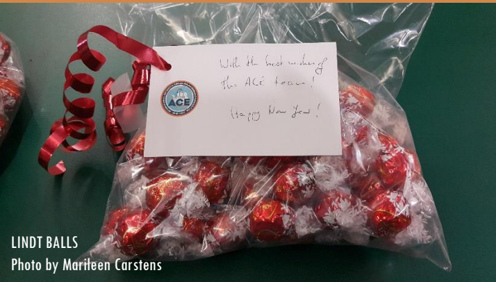
LINDT BALLS