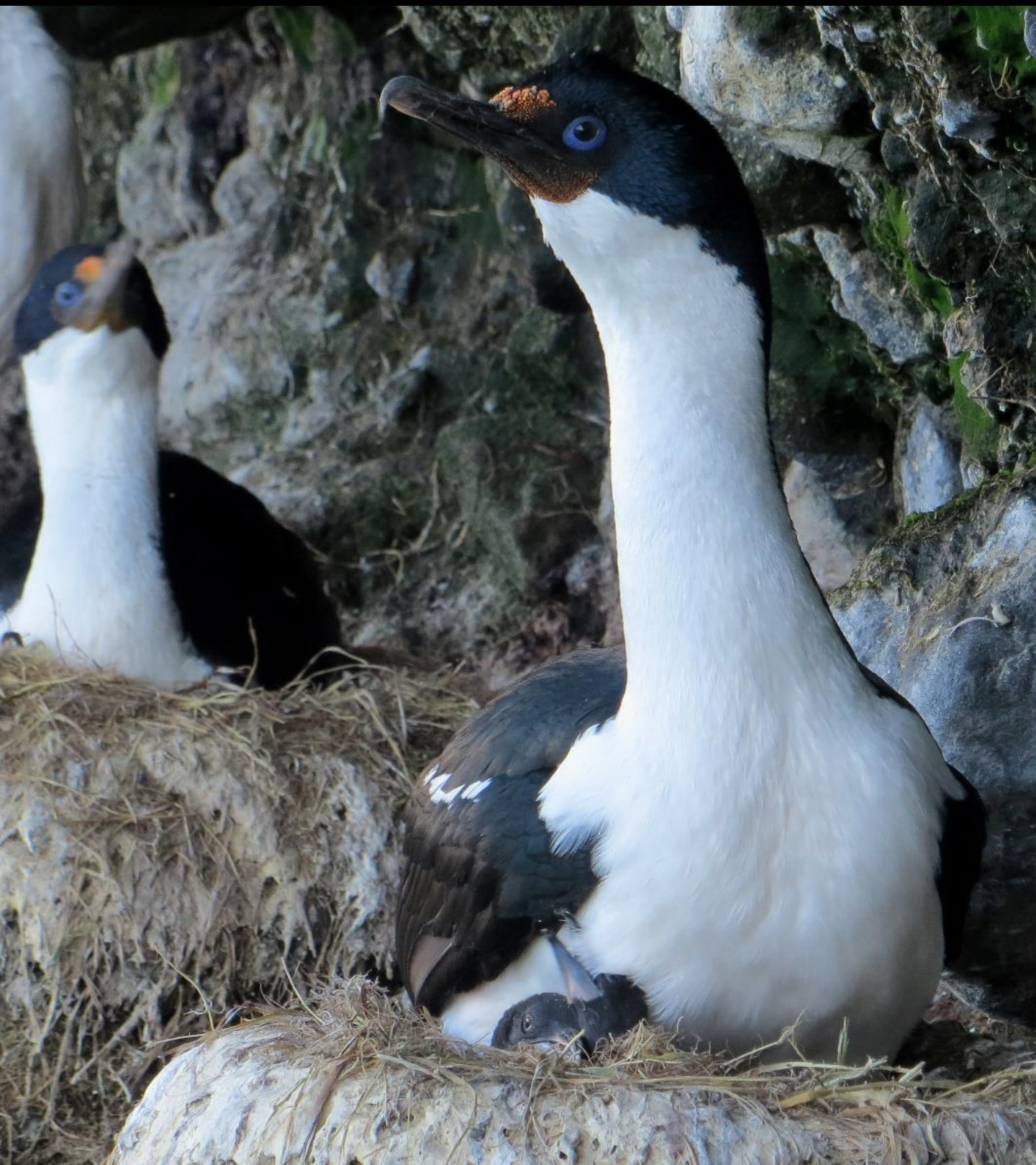
An Imperial Crozet Shag and it's Chicks by Camilla Kotzé

A selection of excellent photographs taken by our team members