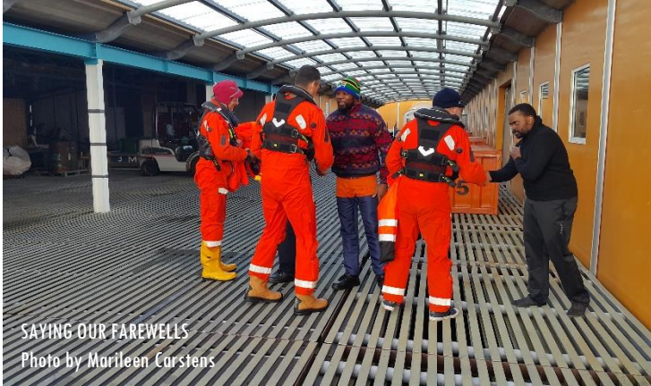
SAYING OUR FAREWELLS

For more information on the events surrounding the ACE cruise and their visit to Marion, have a look at their blog http://spi-ace-expedition.ch/inside-marion/