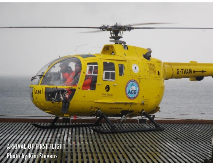
ARRIVAL OF FIRST FLIGHT