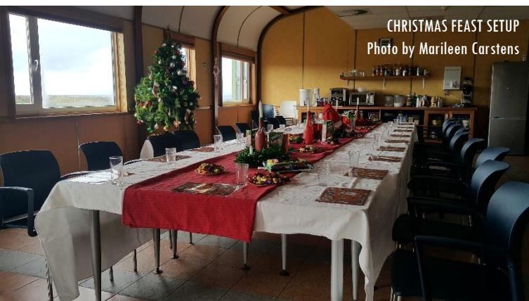
CHRISTMAS FEAST SETUP

With the ACE cruise in the vicinity of Marion and no confirmed time of arrival, M73 decided to go ahead with the Christmas feast preparations. Traditionally, we had a braai as well as a 'lekker kerrie', which was topped off with apple pie and custard. By evenings arrival, the ACE cruise was anchored just outside our front door.