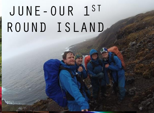
JUNE-OUR 1 ST ROUND ISLAND