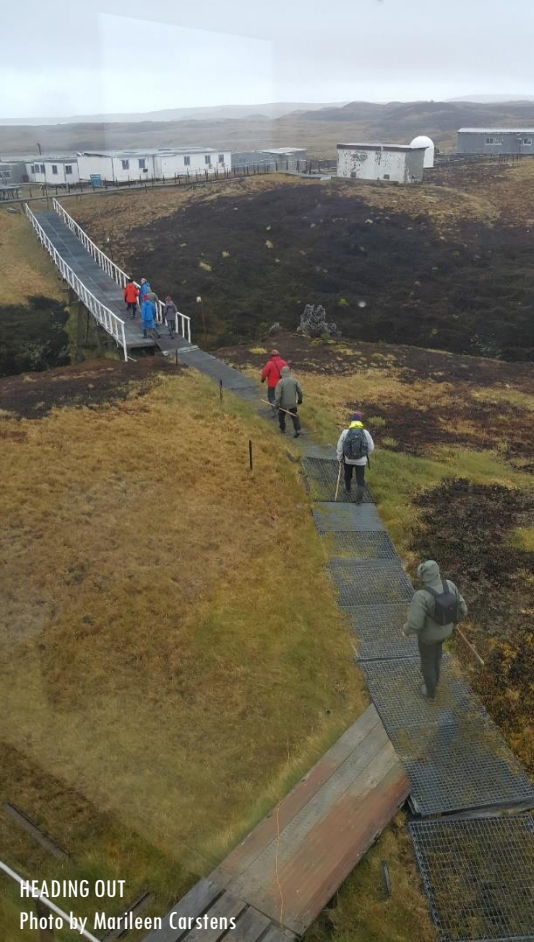
HEADING OUT