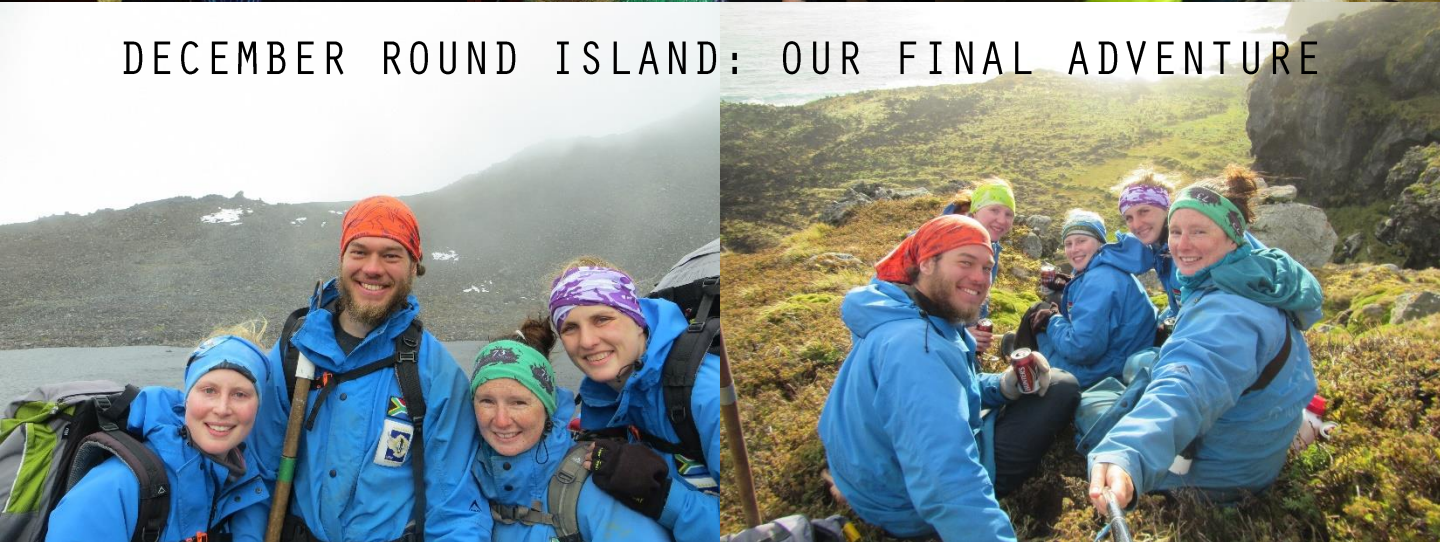
DECEMBER ROUND ISLAND: OUR FINAL ADVENTURE