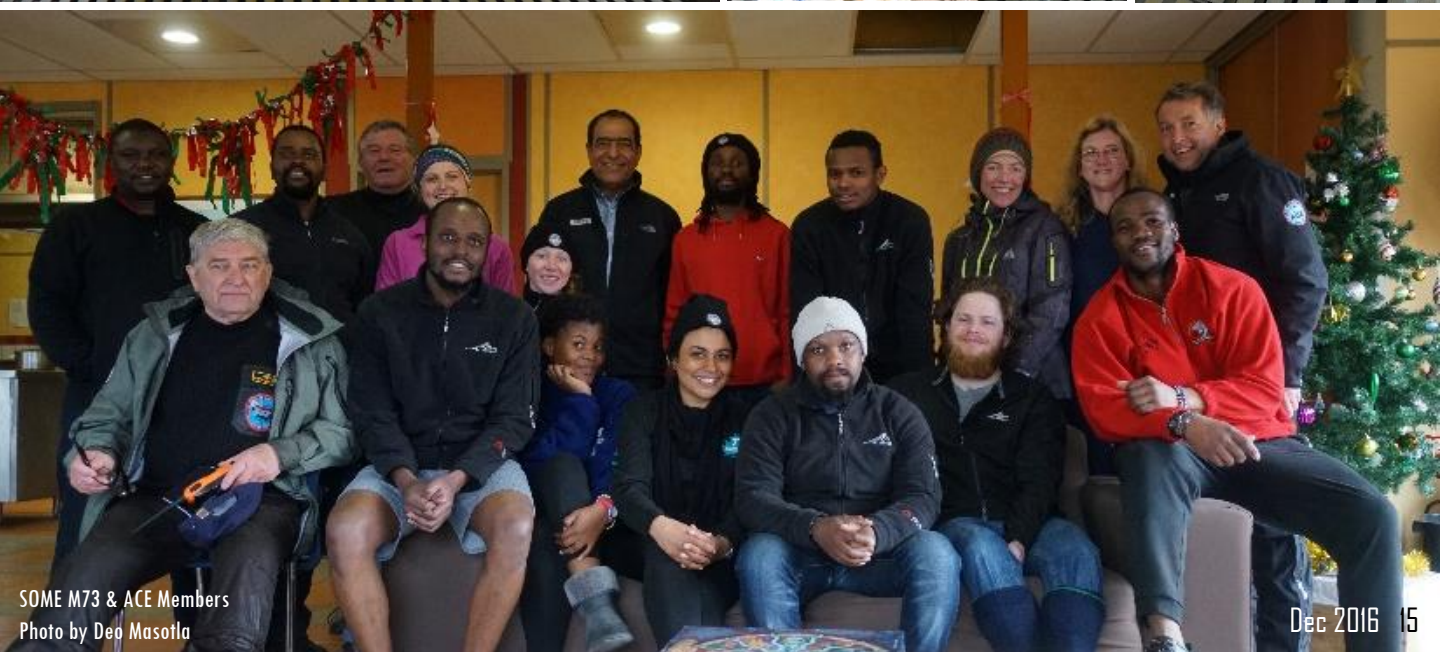
SOME M73 & ACE Members