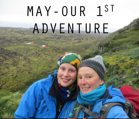
MAY-OUR 1 ST ADVENTURE