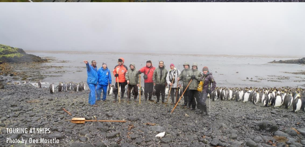
TOURING AT SHIPS