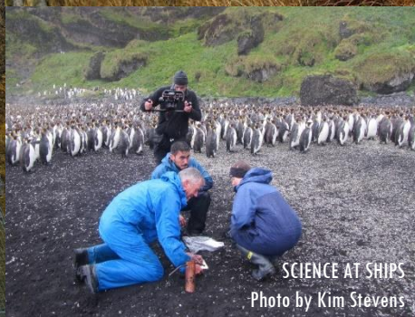
SCIENCE AT SHIPS