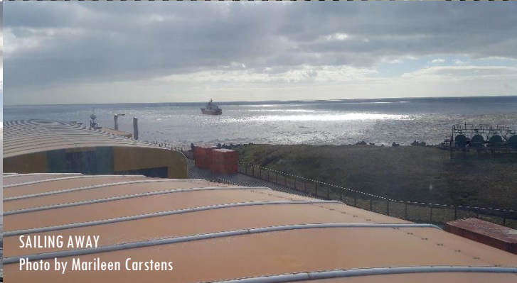
SAILING AWAY