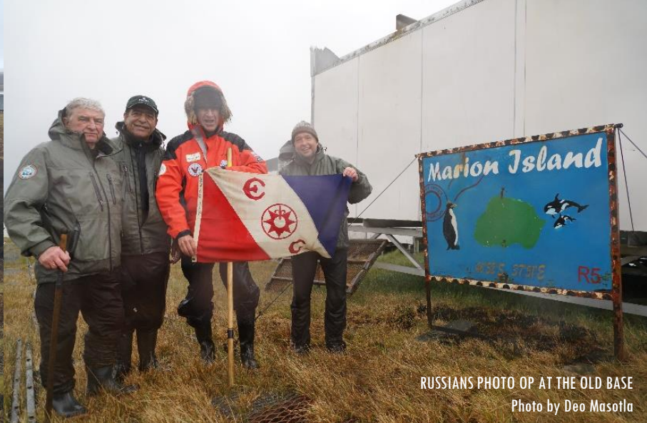
RUSSIANS PHOTO OP AT THE OLD BASE