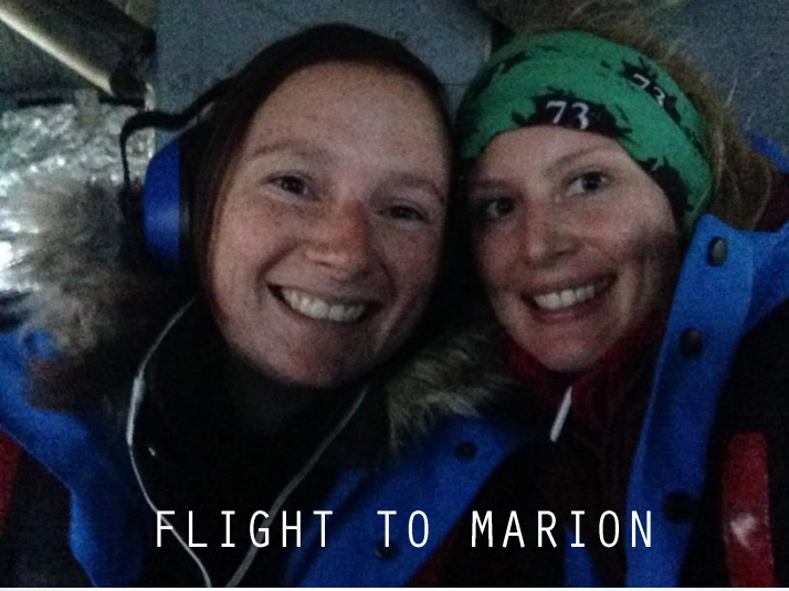
FLIGHT TO MARION