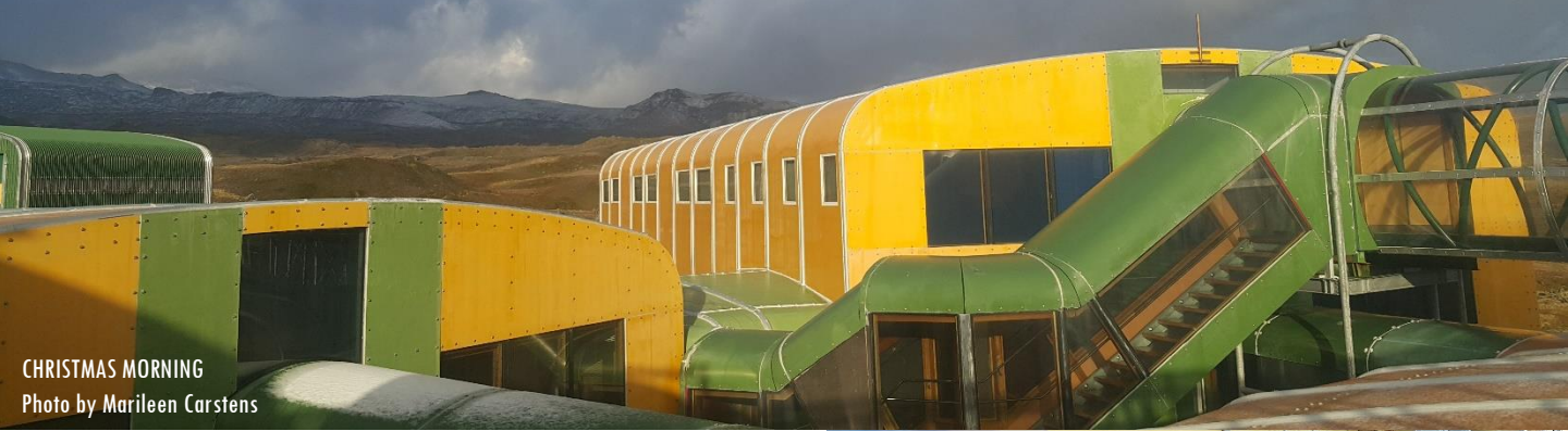
CHRISTMAS MORNING

Christmas day was bright and sunny. It started off with a Christmas breakfast table in the dining room generously set by Elana who had baked muffins and scones for the team. The biscuits were whipped up by Marileen and Alta, tasty morsels in the form of Christmas trees and cherry circles.