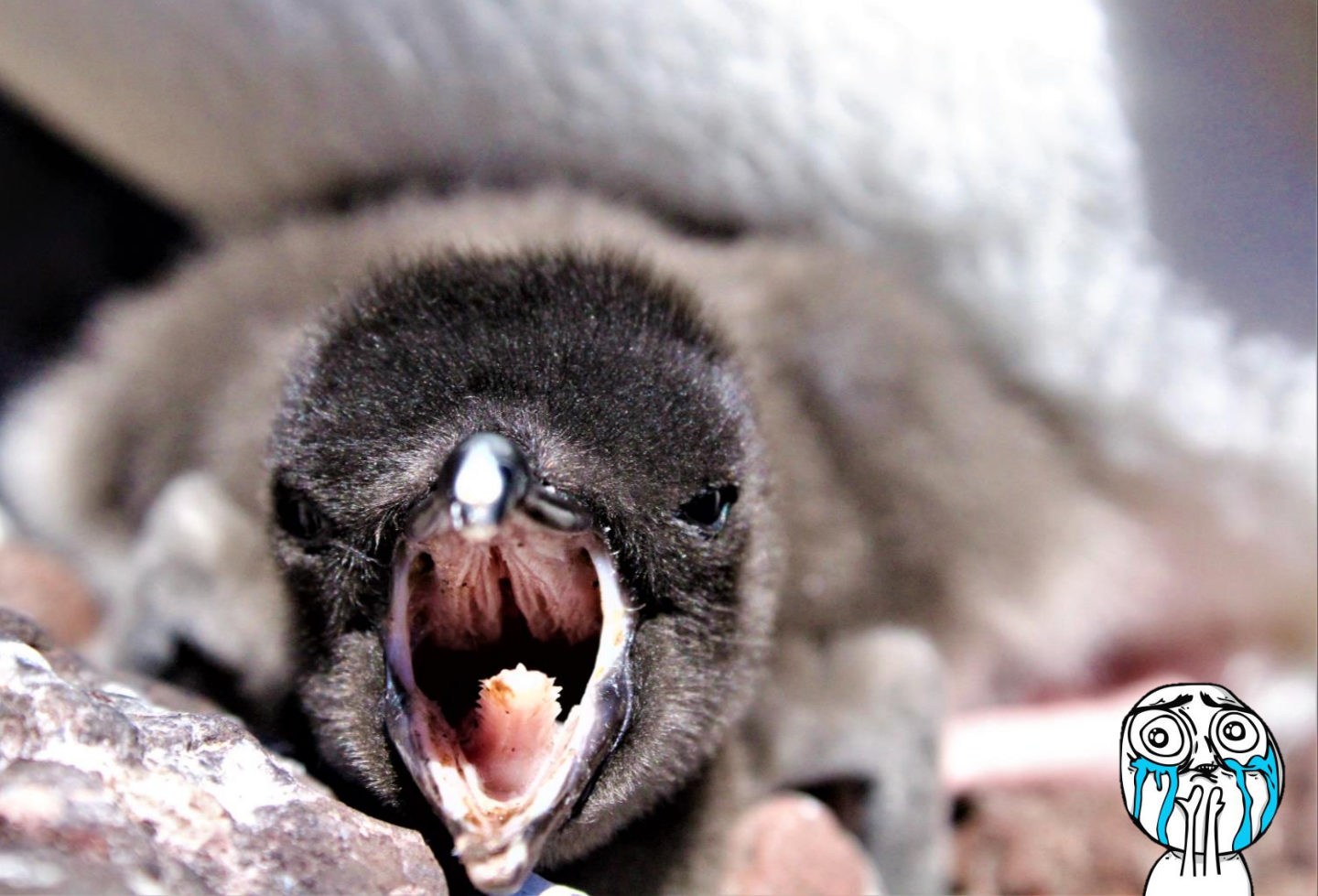
Macaroni Penguin Chicks