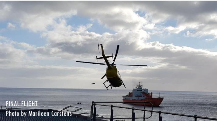
FINAL FLIGHT