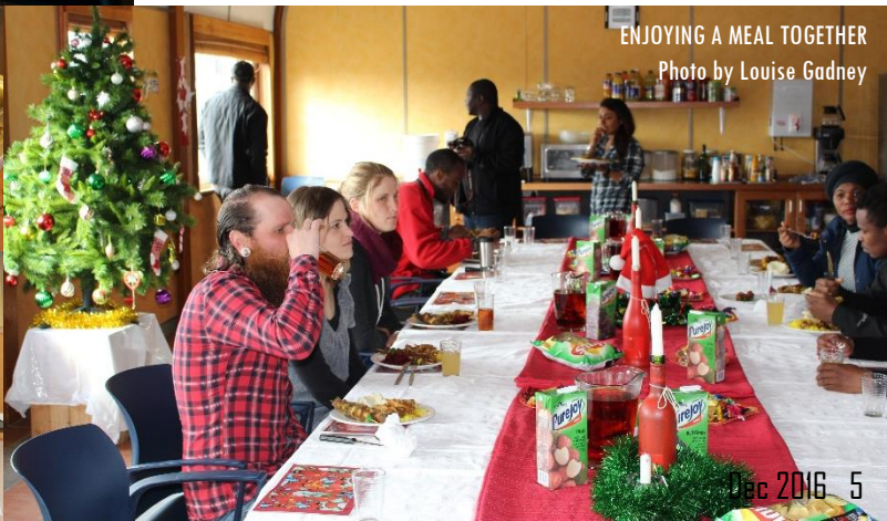
ENJOYING A MEAL TOGETHER