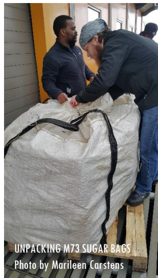
UNPACKING M73 SUGAR BAGS