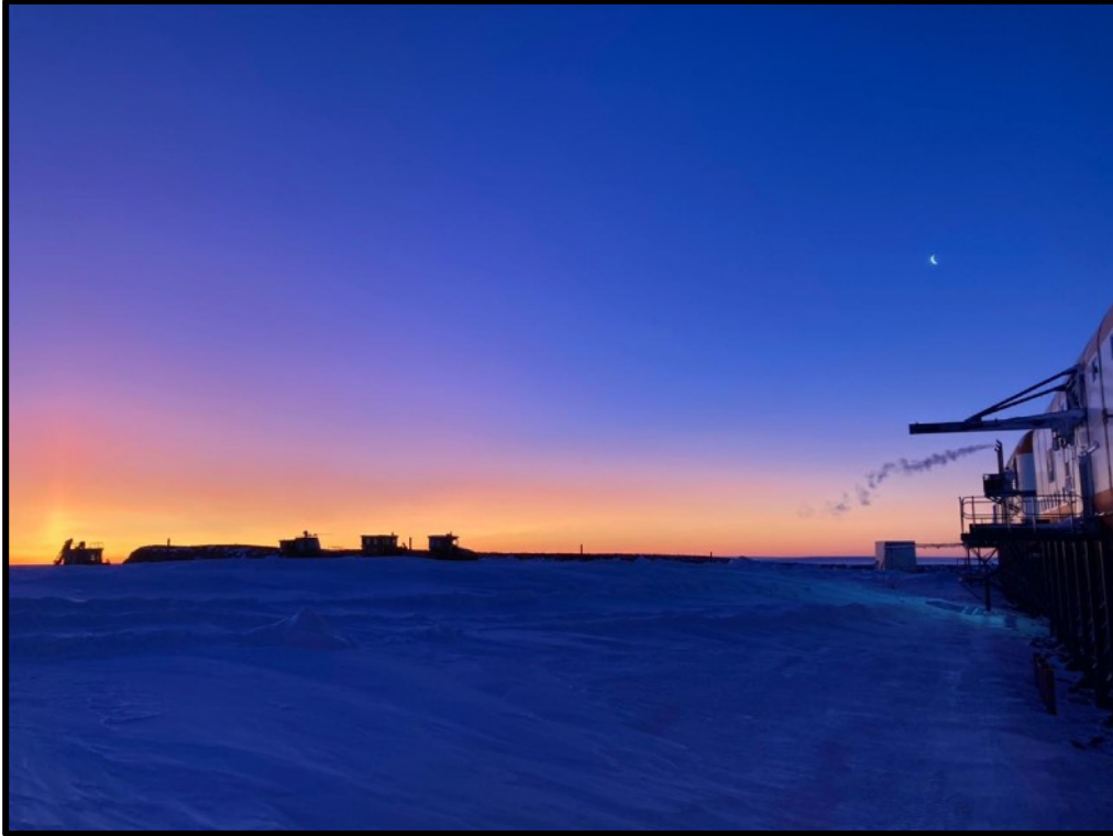
Night vs Day

July, the coldest period of our stay here, started off with mighty winds all through to the end of August. The Sun marked its return with stunning scenes of majestic colour brightening up our dark and pale surroundings; it was bittersweet though as we were unfortunate to be eluded (three times sadly☹) by the Aurora (Southern polar lights).