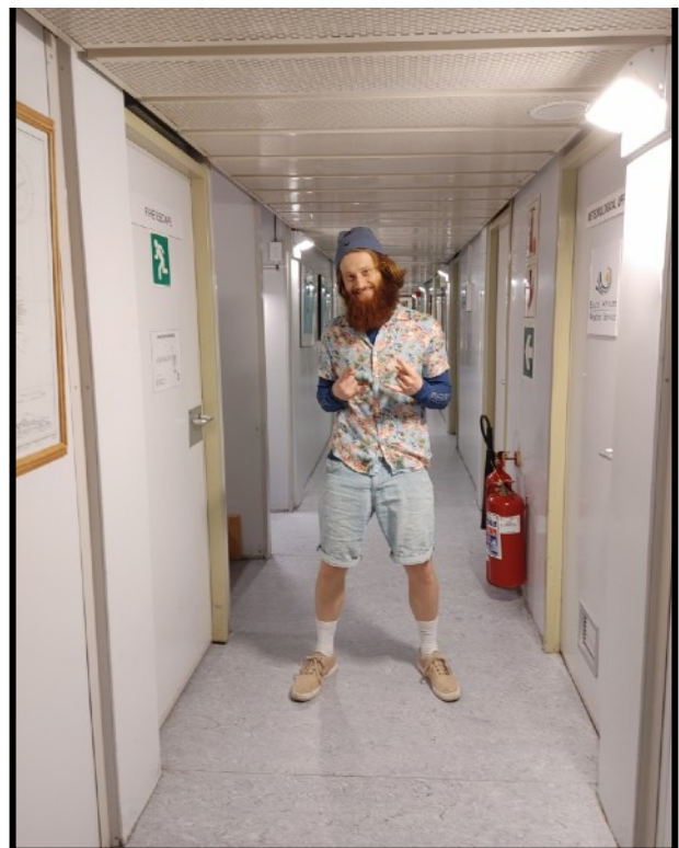
25 year old Viking