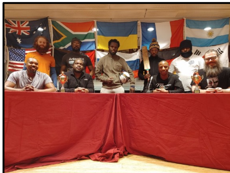
Aurora sports Anchor team

I think the highlight of the two months that have come and gone was the filming our 48 hour film festival movie, the team proved that indeed we are a unit and a big shout out to the guys for the great effort. Inspired by the teams love for football, a Football studio talk show was parodied. Please do check the video out on www.wiffa.aq