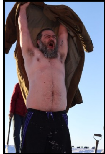
JC conquering the Snow Bath

It is a pleasure to have JC in our team.