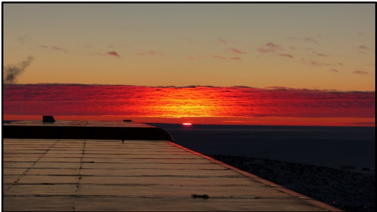
Orange is the colour of light