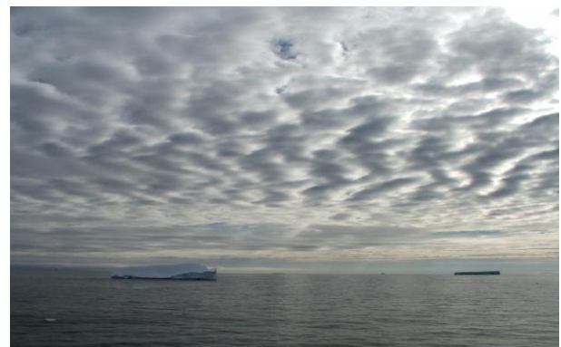
Figure 5-6: Sunsets and vistas at sea.