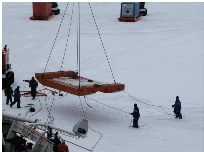
Figure 1-2: Back-loading operations using the crane and crew.

And still back-loading continued and a few more days were spent up in the Monkey Deck seeing the back-loading procedures in progress. These had an additional element of danger this time as summer's peak had passed and the ice was now at its softest and most likely to fail. Back-loading therefore progressed with extreme caution and a sailing crew that was at all times highly alert and aware of the dangerous ice