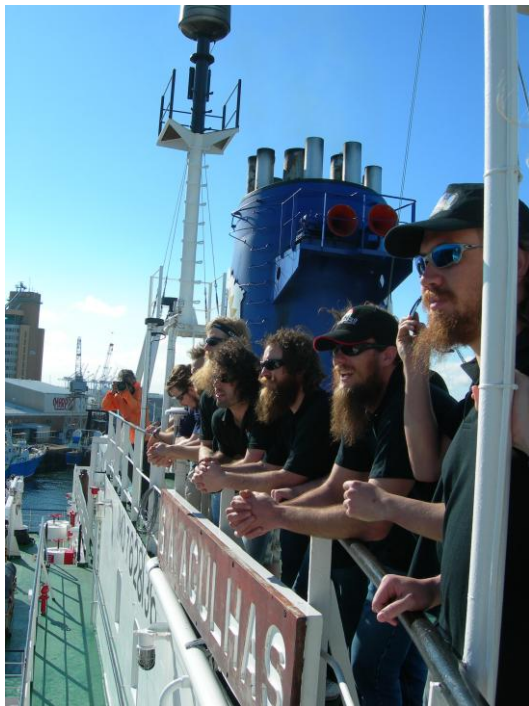
Figure 7: S49 waiting to get off the ship.

The excitement mounted as we crept closer to South Africa and not a wink slept when the news came that Cape Town would be visible the following evening. Bags were packed in a rush, our bills paid to the Bernie the purser, email addresses and telephone numbers exchanged and early goodbyes said. Slowly lights emerged from the sea – initially the lights from other vessels and finally Table Mountain, lit up in all its glory! Telephones started beeping, phone calls made and general happiness (and selective weeping) ensued. However, melancholy set in with the exhilaration felt by all: melancholy because the adventure was over, exhilaration because we were HOME!