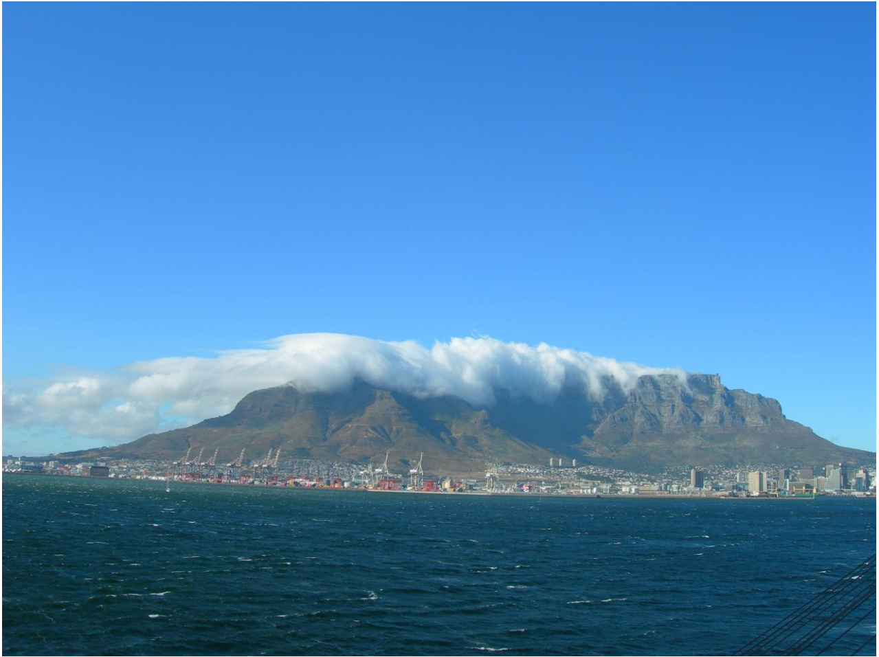
Figure 8: Cape Town! We are home!

For more information on the South African Antarctic Program please visit www.sanap.org.za