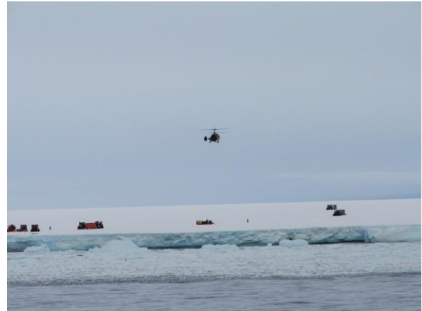
Figure 3-4: Back-loading operations using the Kamov.