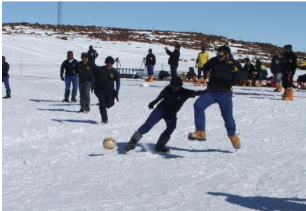
Figure 18: Take-over games: soccer.

beaten by the Scientists, S49 beat Department of Public Works, S50 beat S49 and finally Department of Environmental Affairs, to our chagrin, beat the Scientists. The tug-of-war showcased the superior strength of the caterpillar and helicopter crews and the boot throwing competition showed the surprising strength of a little pipsqueak of a man, who ended up 3 rd . Who would have thought?