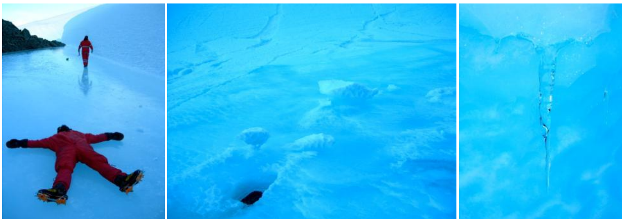
Figures 15-17: Crystal Palace.

The stay at SANAE was also not just work but also play 😊. The DOC of the trip allowed some of the oceanographers from the SA Agulhas to spend New Years at SANAE and again (another group of oceanographers) for the Take-Over party. New Years offered a unique opportunity for the old overwintering crew to get to know everyone else. Needless to say it was a day (as the sun didn't set...) of great fun, starting off with chilling in the games room and bar, progressing to dancing and singing and ending with those still up saluting the new year on the top of the roof. On New Years Day some of us also got to go to the wind scoop, a journey app. 45 minutes away on Ski-Doos. Here we got to see the wonders of Crystal Palace: bubbles caught in blue ice, icicles, snow overhangs that looked like ice cream cones or cotton wool, numerous 'Bergschrunds' (mountain crevasses) and even a section of ice that looked like someone had graded the ice and taken great pains to create a 50m long road – bizarre.