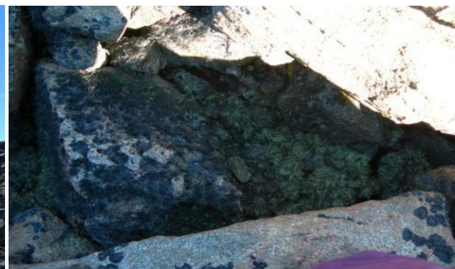
Figure 7: Inspecting the northern wind scoop at Robertskollen.