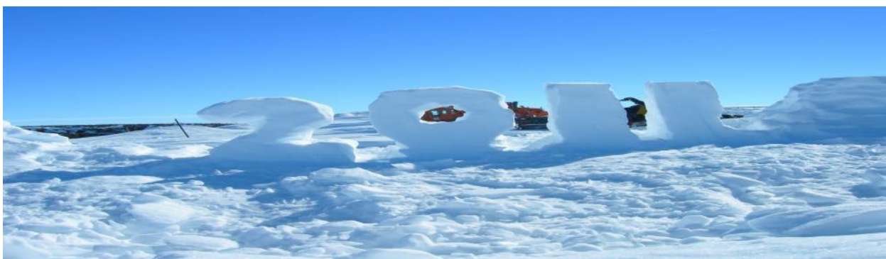
Figure 4: New Years Day: the oceanographer's handiwork on show...