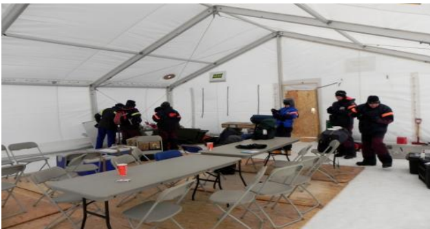
Figure 11: The international 'passenger lounge' at Troll.

Troll is the site of the Antarctic International Airport and has a runway made of blue ice with a thin layer of snow overlying it. The construction was done with a laser that cut the ice to a smooth runway and at places this ice is 1.2km deep, although the average depth is more between 300-500m. Impressive indeed! Our reason to visit Troll was to download a data logger (like the one at Vesles) that measures active layer and permafrost temperatures. This is part of a larger and international project to study the effect that climate change has on these layers as many Northern Hemisphere countries (such as those of Scandinavia) actually use permafrost as the foundation for their buildings. Understandably they are a bit worried that the warming climate might make all their cities fall down on them, allowing us (the South Africans) to travel to Troll 😊!