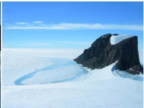
Figure 3: Robertskollen.