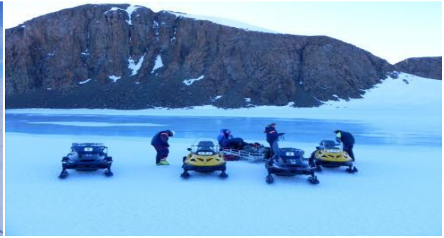
Figure 5: Ski-Doo and geo sled on the way to Robertskollen.