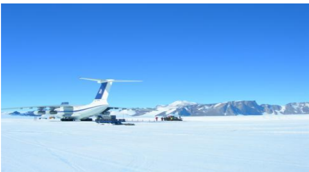
Figure 13: Ilyushin plane.