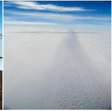
Figure 10: Jutulstraumen gacier.

Troll is the site of the Antarctic International Airport and has a runway made of blue ice with a thin layer of snow overlying it. The construction was done with a laser that cut the ice to a smooth runway and at places this ice is 1.2km deep, although the average depth is more between 300-500m. Impressive indeed! Our reason to visit Troll was to download a data logger (like the one at Vesles) that measures active layer and permafrost temperatures. This is part of a larger and international project to study the effect that climate change has on these layers as many Northern Hemisphere countries (such as those of Scandinavia) actually use permafrost as the foundation for their buildings. Understandably they are a bit worried that the warming climate might make all their cities fall down on them, allowing us (the South Africans) to travel to Troll 😊!