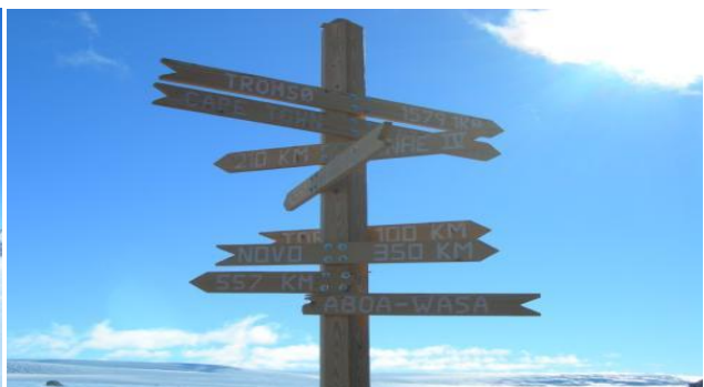
Figure 14: Directions to various locations on the globe from Troll.