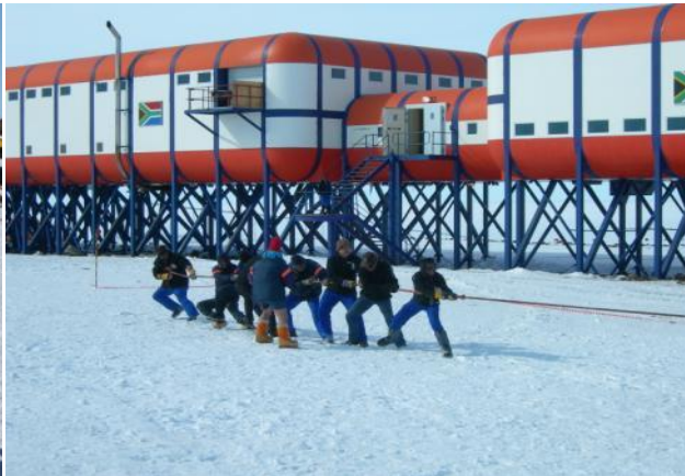
Figure 19: Tug-of-war.

The Take-Over function was also quite a big event as it is the official handing over of the base to the new overwintering team. The dining room was kitted out in fancy tablecloths and the cutlery was polished (as much as stainless steel can be polished), crew members got dressed in their poshest clothing (which didn't mean much), speeches were held and awards handed over. This was, as per usual, accompanied by a 5 course mouth-watering meal and delightful wines. Snow baths had for those whose birthday fell in the time of the Take-Over, the RADAR system explained to me and pretty much every nook and cranny of the base explored.