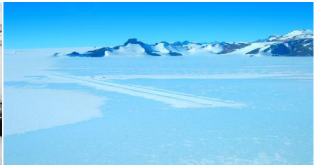
Figure 12: Runway at Troll.