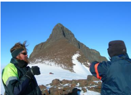
Figure 1: Coffee break at Lorentzenpiggen.

But what did we really do at SANAE? We surveyed the blockfield on the Northern Buttress of Vesles (the site for my MSc), took Ski-Doo rides to Robertskollen and Lorentzenpiggen to measure tafoni and took helicopter rides to Flarjuven to download a data logger, Valterkulten to collect more tafoni data as well as to observe a brine lake (yes, a LAKE in the Antarctic, no kidding) and Troll, the Norwegian station to download another data logger. Of all the study sites, with the exception of the Northern Buttress, Lorentzenpiggen was the closest. Our day started at 4am and by 6am we had traversed the 7km to 'Piggen' and were ready to measure tafoni (honeycomb weathering on rocks). But by 8am the weather had gotten so terrible that fingers went numb, snow goggles wouldn't de-fog and even our field assistant and member of S49 (the old overwintering crew) was getting uncomfortable. So we sped through our sampling whilst still maintaining the required diligence and accuracy (difficult to do when you can't feel your toes or finger tips), drove over the ice plain back to Vesles (when my Ski-Doo started making ominous noises) and were flabbergasted when the weather at SANAE was warm and beautiful! Who would have thought that 7km could make such a difference?