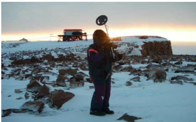
Figure 21: The in-vain search for the elusive iButton.

But in the end even my time at SANAE had to come to an end. After having been in the field almost every day, having had field assistants that included a historian, S49 members, oceanographers and fellow Geos, having traversed countless kilometres of razor sharp rocks and fields of ice, a multitude of helicopter and Ski-Doo rides, twice falling on my knees so I can still hear the crunching when I walk now, slipping on the