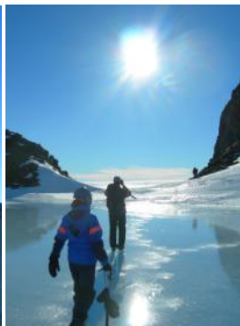
Figure 2: Walking on ice.