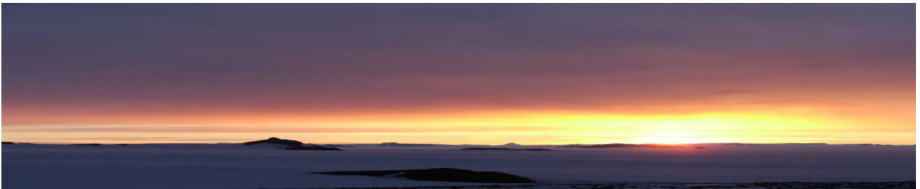
Figure 22: Our first sunset of the year.

ice more than can be counted (to the merriment of others), having my study site first snowed in and then becoming a mini-hotspot when the weather became uncharacteristically warm (at around -1^{\circ}\text{C} ), planting iButtons to collect data, not finding one, using a metal detector to discover its location and STILL not finding it and finally resorting to just having fun with a metal detector in the Antarctic (how could we not?), stressing, being extremely puzzled, exhausted sleep and made many new friends the time had come to pack our bags. When we were told that we would fly the next day due to bad weather coming in (having thought we had at least a week left) the base became a hive of elevated activity. One after one the helicopter loads left, the base became like a ghost town and the remainder of us ( app. 20) got to spend our last day at SANAE seeing the first sunset of the year – a truly magical event, giving a fitting closure to my time on the Antarctic continent. So the time had come to head back to the SA Agulhas, newly returned from her trip in the Atlantic, the Sandwich Islands and South Georgia and (again) our home for the next 3 weeks.