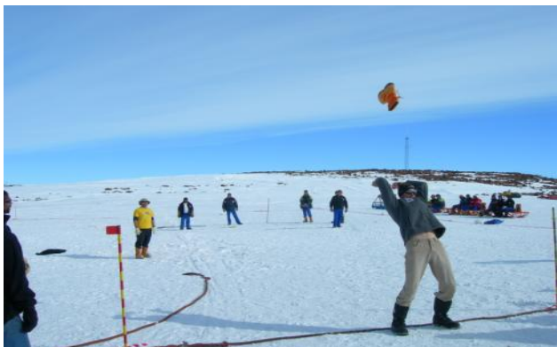
Figure 20: Boot throwing competition.

The Take-Over function was also quite a big event as it is the official handing over of the base to the new overwintering team. The dining room was kitted out in fancy tablecloths and the cutlery was polished (as much as stainless steel can be polished), crew members got dressed in their poshest clothing (which didn't mean much), speeches were held and awards handed over. This was, as per usual, accompanied by a 5 course mouth-watering meal and delightful wines. Snow baths had for those whose birthday fell in the time of the Take-Over, the RADAR system explained to me and pretty much every nook and cranny of the base explored.