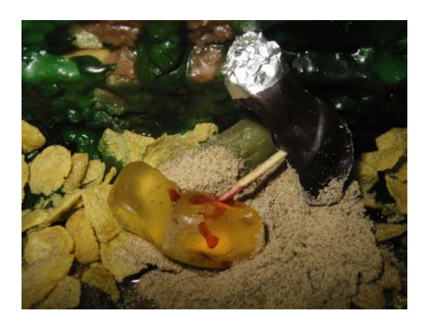
*Squirt* ... aarrrgggggghhhh ... blood

CIA<sup>5</sup> were quick to get the vitals from the Prisoners of War.