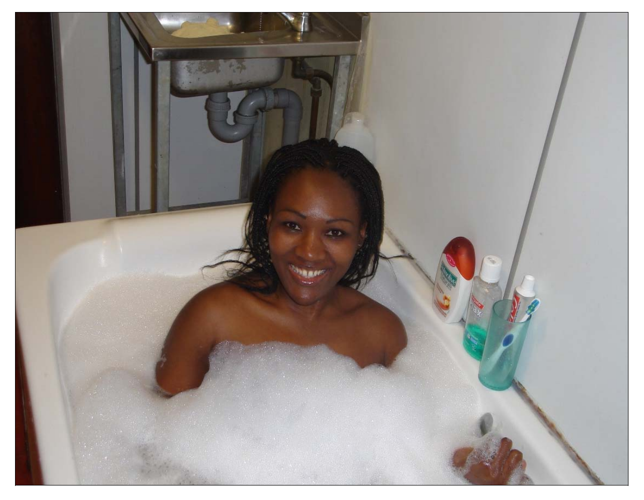
M65 shiny white teeth with smooth skin thanks to Colgate palmolive