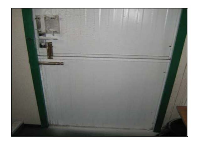
"the frozen door in the morning"

bolt and it was threatening to brake, so we had to tie a rope in the handle to the hangers on the wall. This plan worked as the door was at least secured. Tomorrow I am going back to Katedraal but am even expecting that the top-door is ripped off the frame as it wasn't holding tight at all.