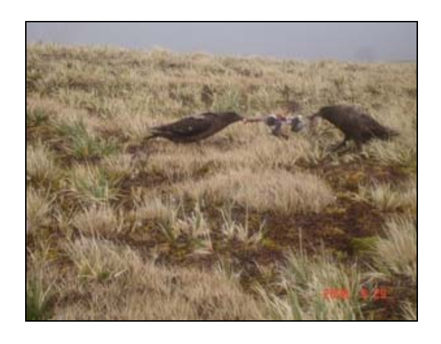
"A pair of Skua's feeding on a burrowing bird"

On the September month, I was working on the coast when the animals that are now breeding (e.g. Gentoo Penguins, Fur seals, Elephant seals, King Penguins to name few) in the island arrive in the beach and in less than 5 minutes then pass the famous Orca or two hunting. That to me simply suggest that for them life in the water is the Survival of the fittest. On Monday morning while I was working next to King Penguin colony at Kildalkey, I saw more than five penguins that were severely bleeding. That to me suggest that they were missed by one of their predators in the water & or in the colony itself.