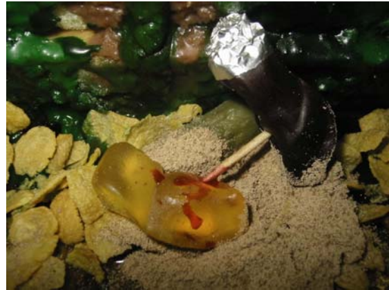
*Squirt* ... aarrrrggggghhhh ... blood

CIA 5 were quick to get the vitals from the Prisoners of War.