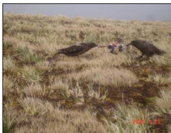
“A pair of Skua’s feeding on a burrowing bird”

On the September month, I was working on the coast when the animals that are now breeding (e.g. Gentoo Penguins, Fur seals, Elephant seals, King Penguins to name few) in the island arrive in the beach and in less than 5 minutes then pass the famous Orca or two hunting. That to me simply suggest that for them life in the water is the Survival of the fittest. On Monday morning while I was working next to King Penguin colony at Kildalkey, I saw more than five penguins that were severely bleeding. That to me suggest that they were missed by one of their predators in the water & or in the colony itself.