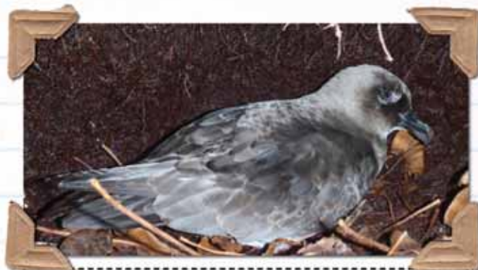
An Atlantic petrel (Pterodroma incanta) in its burrow.