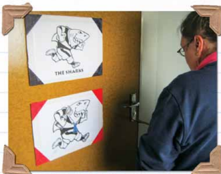
Guess who sleeps in THIS room...