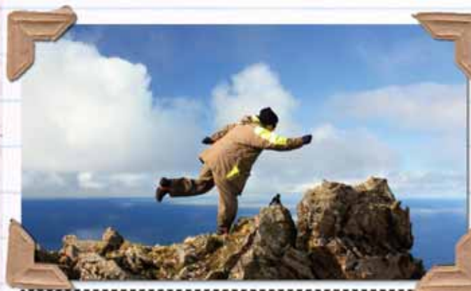
From Leonie: "For Vickus"