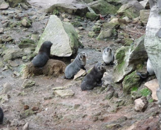
Left – the pups in January. Right – the pups in May.

It was very good to get out and enjoy the beauty of Gough again. I had a very good time at Tumbledown, and it was probably the highlight of May for me. However, one should not underestimate the value of spending a lot of time at base. Apart from having the unique opportunity to completely overindulge in movie watching, there is also the opportunity to