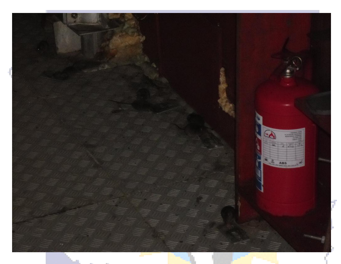
Competition to get caught is fierce.

observe and study the co-inhabitants. I am of course referring to the notorious Gough mice. It is my task to make their stay uncomfortable. I do so by using the common peanut butter scented snap – trap. They find the combination irresistible, and competition to get caught is fierce.