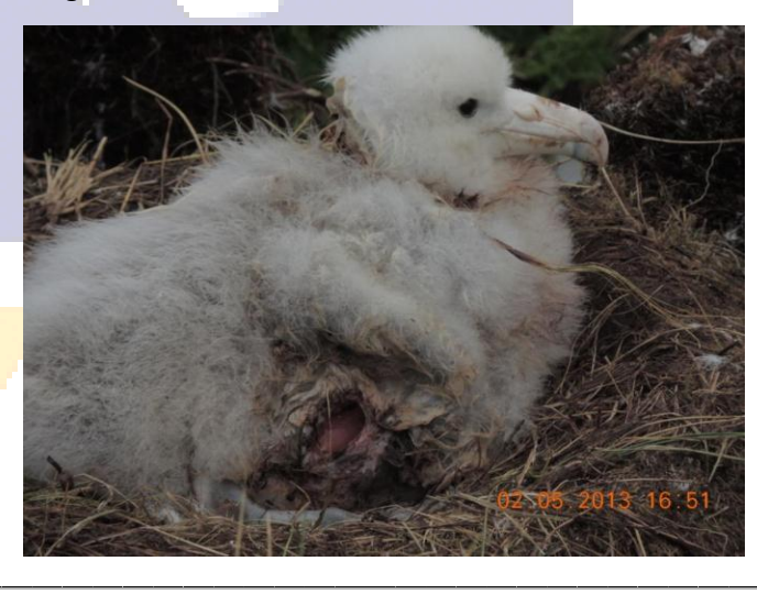
Right: nest HMC60