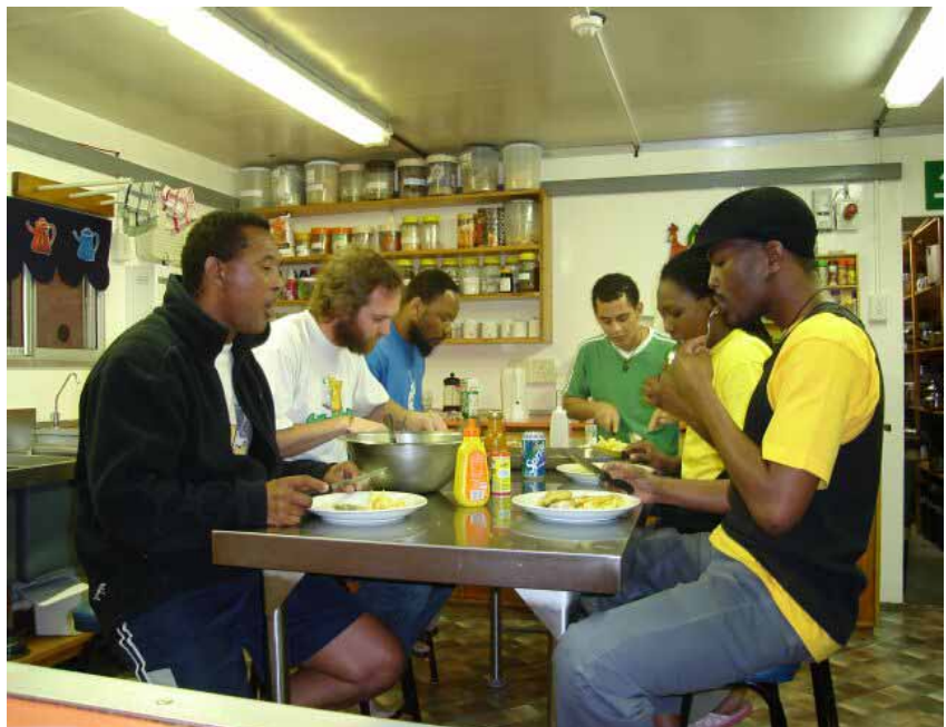
Its supper time and I have prepared fish & chips.