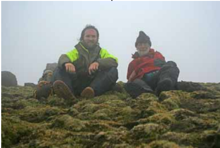
The view from the top of Edinburgh Peak