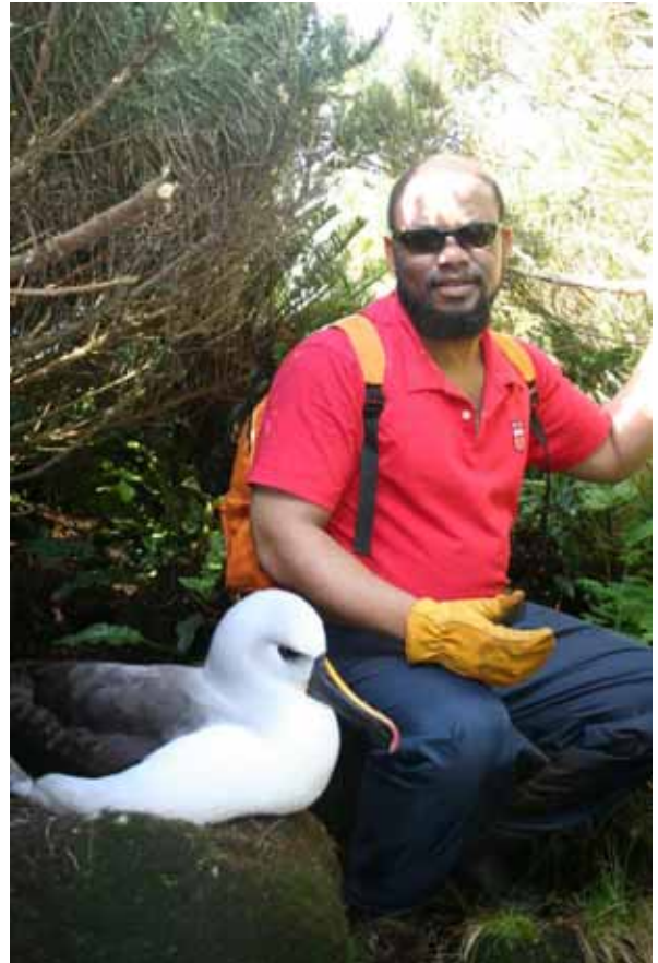
It was a hot sunny day and I was on my way to Prion Cave and the bird below is a Yellow Nosed Albatross.

If it's a good day we normally go out to see the beauty of the Island. I enjoy having a good meal before I leave the base for a hike because a "Man must believe in himself at all times" .