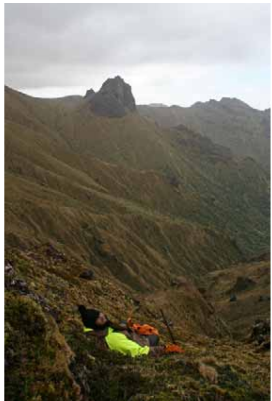
Cyril enjoying the view of Hag's Tooth