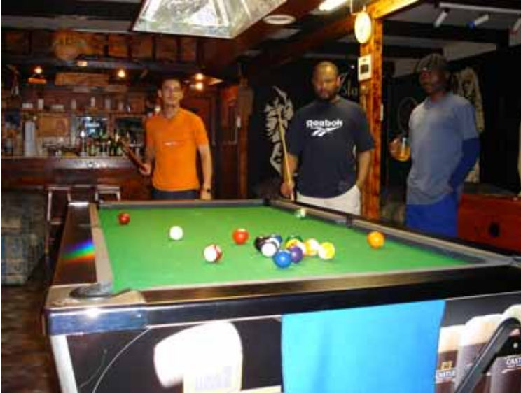
The Skuas playing pool

To be at Gough Island, is a dream come true because not every one gets this opportunity to explore. I enjoy every moment in the Island and I'm glad to have a wonderful team. I enjoy playing pool, darts, and table tennis.