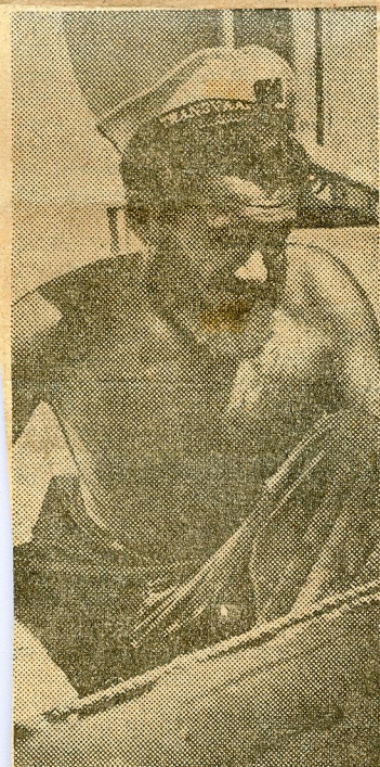
Although the Royal Navy is said to be losing some of its affection for bearded lower-deck men (always relegating them to the